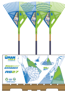
48x40 Pallet Display filled with 40 units